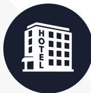
Hotels & Enterprises