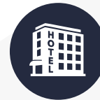
Hotels & Enterprises