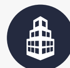
Medium Size Offices

Wifi-soft LLC 815-A Brazos St, Suite 326 Austin, Texas - 78701 U.S.A.